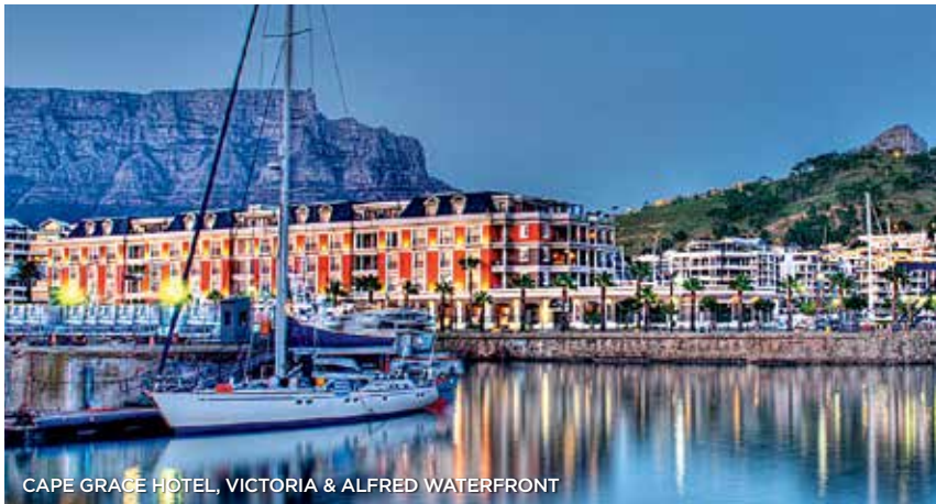
CAPE GRACE HOTEL, VICTORIA & ALFRED WATERFRONT

Ideally located on a private quay on the Victoria & Alfred Waterfront and the tranquil yacht marina, the Cape Grace provides the perfect vantage point to soak in the natural beauty of Cape Town. The elegant and warm atmosphere, evident in every fine detail, begins at the welcoming reception lounge and extends to their 120 spacious rooms. AmaWaterways' guests stay in the Luxury rooms, which feature French doors, offering one of the best views of the harbor front. Captivate the senses with vibrant cuisine infused with local flavors at Signal Restaurant. Indulge in tiers of savory and sweet treats during the hotel's time-honored afternoon tea. The Cape Grace also boasts one of the largest whisky collections in the Southern Hemisphere, as well as one of the best selections of South African wines at Bascule Bar. For those who wish to immerse themselves in an oasis of tranquility and revitalize both the body and soul, the spa at the hotel is the ideal place.