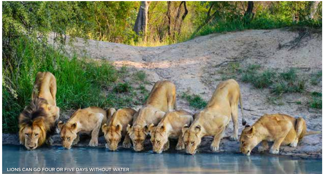
LIONS CAN GO FOUR OR FIVE DAYS WITHOUT WATER

DAY 4, CAPE TOWN - KASANE, BOTSWANA - ZAMBEZI QUEEN - EMBARKATION. In the morning, transfer to the airport for a flight to Kasane, Botswana via Johannesburg. Here, you'll be transferred to the Chobe River where tender boats take you to the Zambezi Queen moored on the Namibia side of the river. Settle into your stateroom, enjoy a late lunch, and in the evening, be treated to a Welcome Cocktail Reception and Dinner. (B,D)