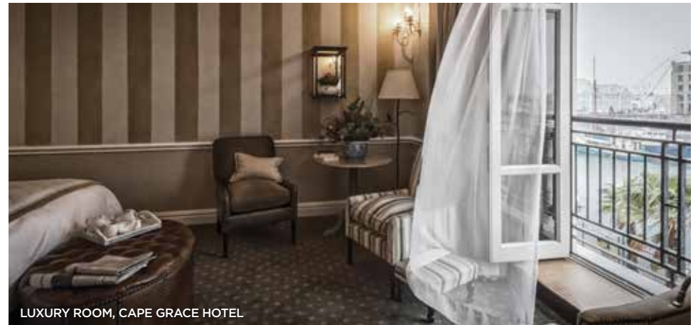
LUXURY ROOM, CAPE GRACE HOTEL