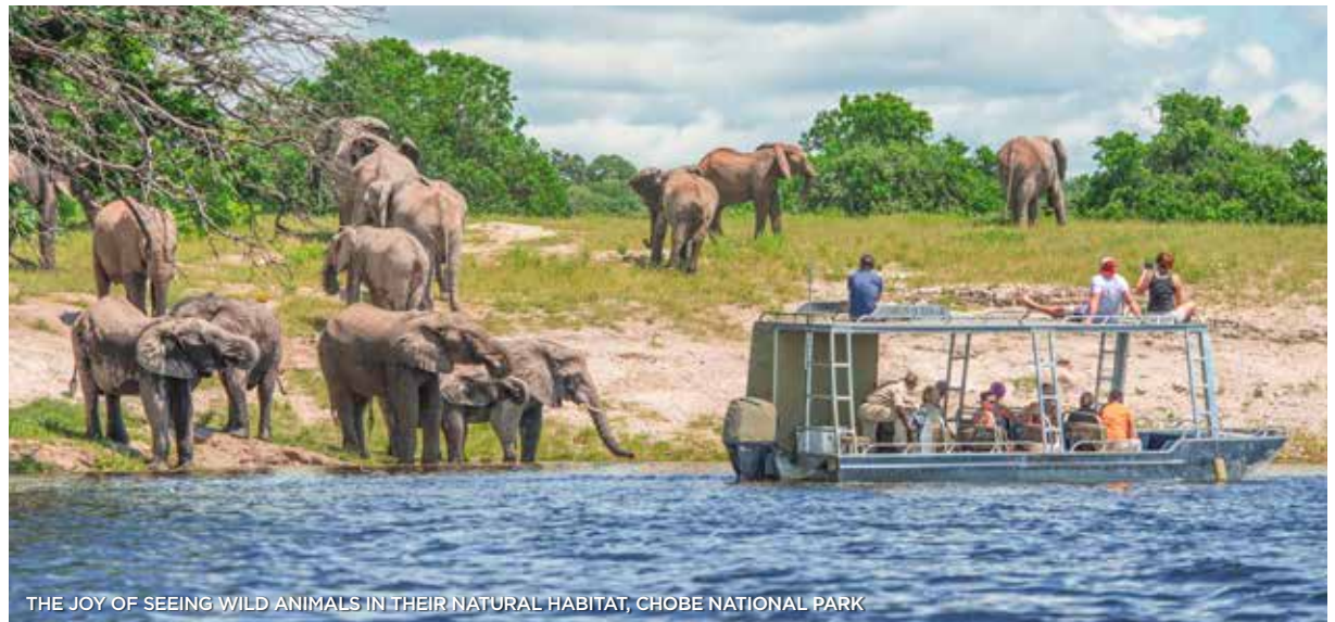
THE JOY OF SEEING WILD ANIMALS IN THEIR NATURAL HABITAT, CHOBE NATIONAL PARK

DAY 7, ZAMBEZI QUEEN. Visit a typical African village where you'll spend time with the village children as well as its elders. Back on board and following lunch, you'll