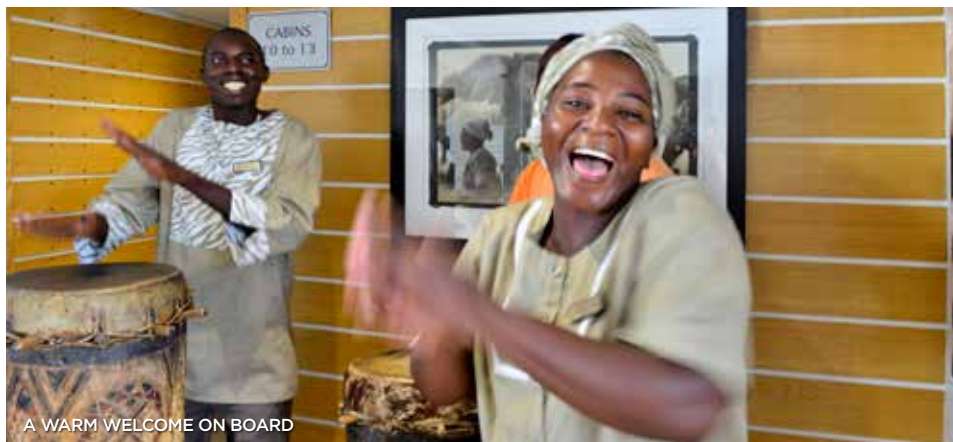
A WARM WELCOME ON BOARD

Bountiful breakfasts and lunches prepare you for your invigorating daily adventures, and during the evening, you will enjoy multi-course dinners. Throughout the day, be treated to complimentary South African wines, beer, local spirits, soft drinks and bottled water. During one of the nights, enjoy an African-themed dinner with traditional dishes and entertainment.