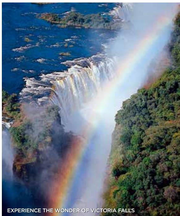
EXPERIENCE THE WONDER OF VICTORIA FALLS

DAY 3, ZAMBEZI QUEEN. Embark on an exhilarating morning boat safari, exploring the Chobe River's diverse game. Afterwards, return to the Zambezi Queen for lunch. During the afternoon, you'll meet an environmentalist, who'll share his insight on Chobe National Park and the its animals. Later in the day, enjoy another thrilling boat safari. (B,L,D)