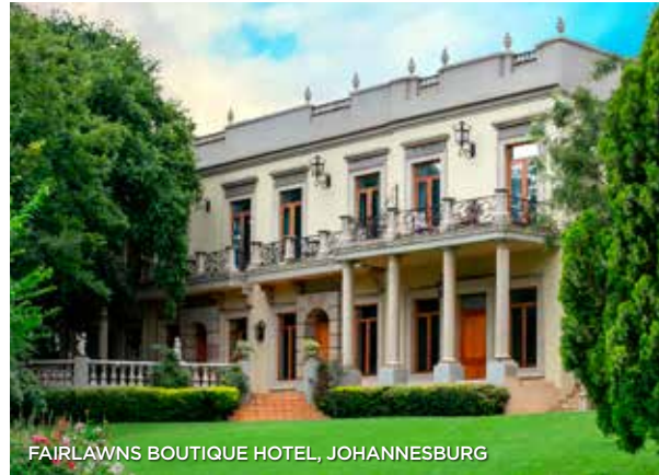
FAIRLAWNS BOUTIQUE HOTEL, JOHANNESBURG

Situated in a tranquil park-like setting with huge, mature trees in the prestigious neighborhood of Morningside Manor lies Johannesburg's Fairlawns Boutique Hotel and Spa—your home away from home, where exceptional service and heartfelt hospitality can be soaked up like the African sun. AmaWaterways guests stay in Grand Château suites, each individually designed and built to local, eco-friendly standards. The hotel also caters to a variety of culinary tastes with an array of elegant dining experiences from which to choose; and its Balinese-style spa, located in the exquisite bamboo forest gardens, offers a range of therapies and signature Asian-inspired treatments.