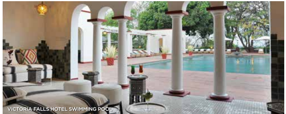
VICTORIA FALLS HOTEL SWIMMING POOL