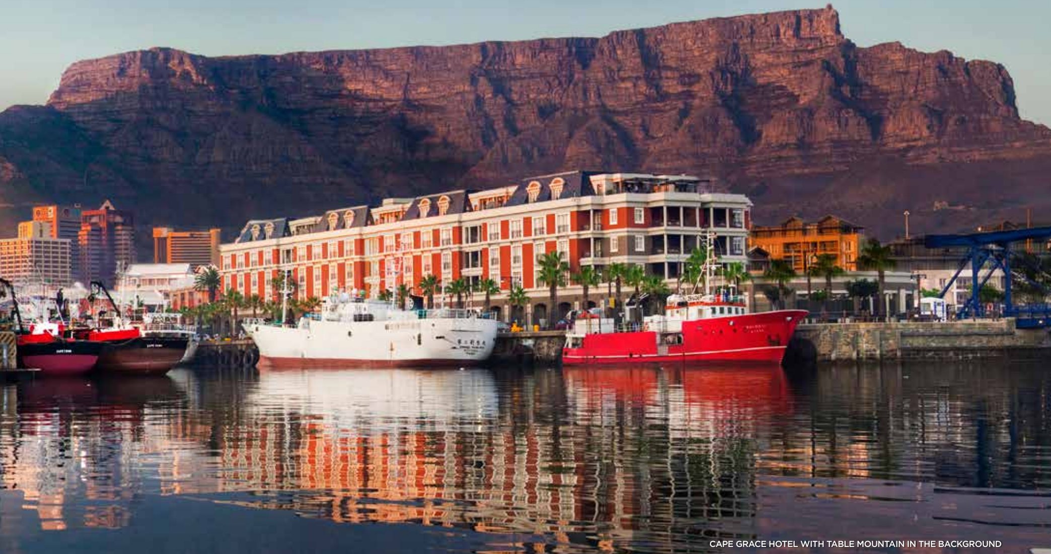
CAPE GRACE HOTEL WITH TABLE MOUNTAIN IN THE BACKGROUND