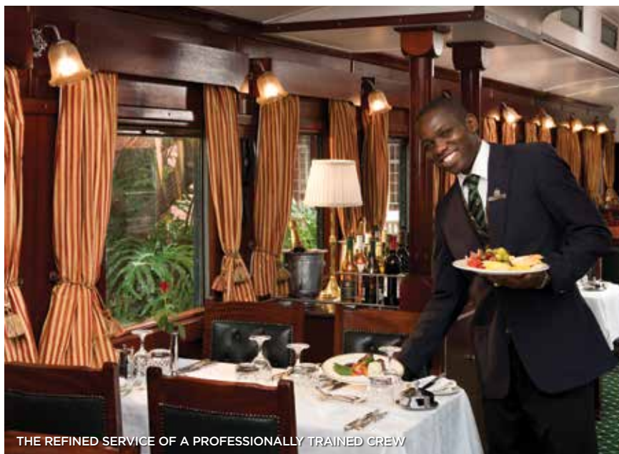
THE REFINED SERVICE OF A PROFESSIONALLY TRAINED CREW

Continuing towards Pretoria, you will be met by lush, mauve blossoms and Jacaranda trees lining streets, and possibly even a flock of preening peacocks. Through it all, you'll be able to watch the passing world at the pace of a time gone by, but with all the comforts and conveniences of modern day.