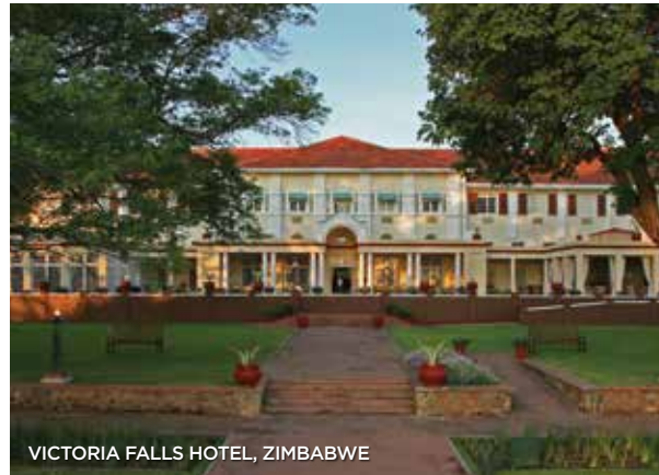
VICTORIA FALLS HOTEL, ZIMBABWE

One of the world's classic five-star hotels commands a prime location overlooking Victoria Falls. This Edwardian-style hotel, built in 1904, was splendidly remodeled in 2013 to combine its traditional majesty with modern sophistication. As one of the oldest hotels in Africa, the Victoria Falls Hotel serves as a reminder of the distinguished and elegant era in which it was born, with its Edwardian-style décor, broad verandas and tropical gardens with lily ponds and palm trees. The hotel presents a connoisseur's delight of dining options in both the Livingstone Room and the thatched, outdoor-style Jungle Junction, where internationally-trained chefs create exquisite dishes. AmaWaterways guests stay in the upgraded Deluxe Stable Wing rooms furnished in a modern style with a bygone feel. Bathrooms incorporate world-class amenities and a Victorian bathtub with large, separate walk-in shower.