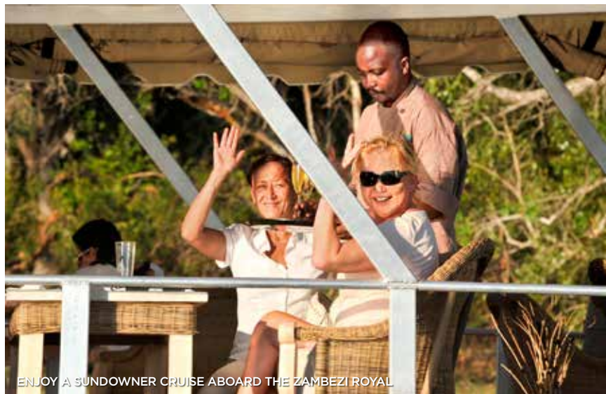
ENJOY A SUNDOWNER CRUISE ABOARD THE ZAMBEZI ROYAL

Forming the border between Zimbabwe and Zambia, Victoria Falls and its surrounding national parks are home to sizeable populations of elephants, buffaloes, giraffes and zebras. Vervet monkeys and baboons are also quite common, and the Zambezi River above the falls contains a large population of hippos and crocodiles. The area’s surrounding vegetation is woodland savannah, with the most notable exception being the unique rainforest immediately adjacent to the falls, which is nurtured by the spray generated by it. Rare flora for the area grow here, including ebony, pod mahogany and date palms. Vibrant rainbows are often spotted as well at both daytime and nighttime, and Victoria Falls is one of the few places in the world where this elusive evening moonbow can be seen.