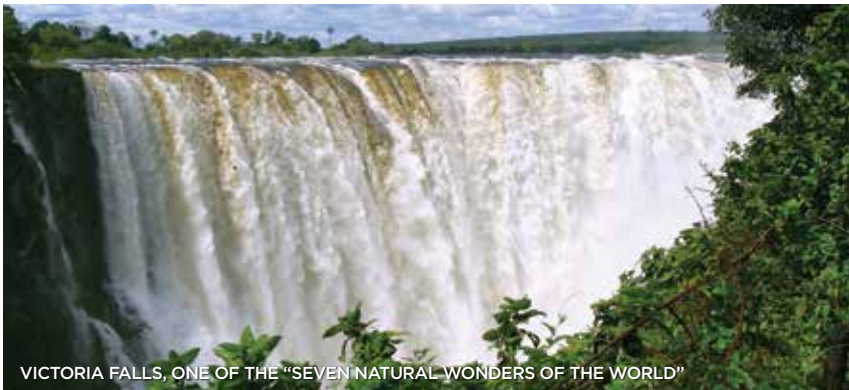
VICTORIA FALLS, ONE OF THE "SEVEN NATURAL WONDERS OF THE WORLD"