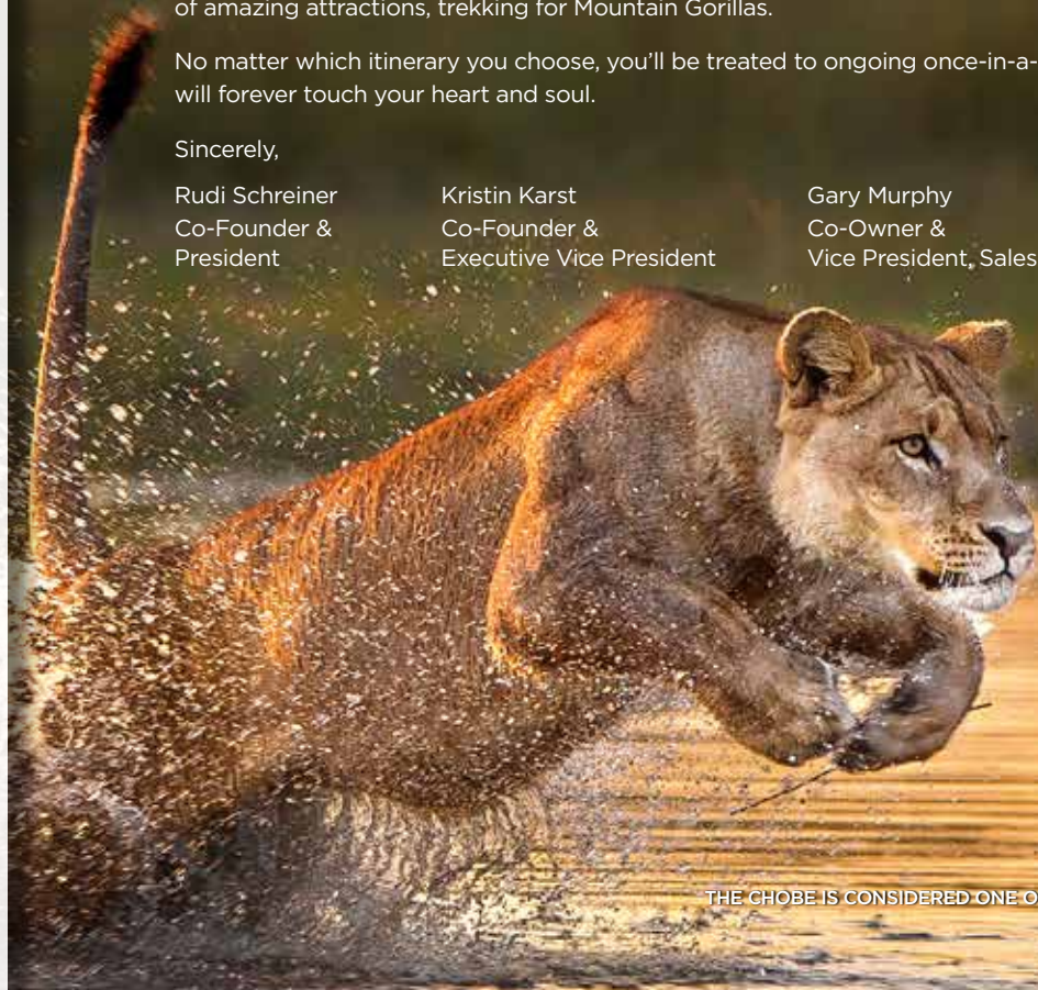
THE CHOBE IS CONSIDERED ONE OF AFRICA'S GREATEST WILDLIFE REGIONS