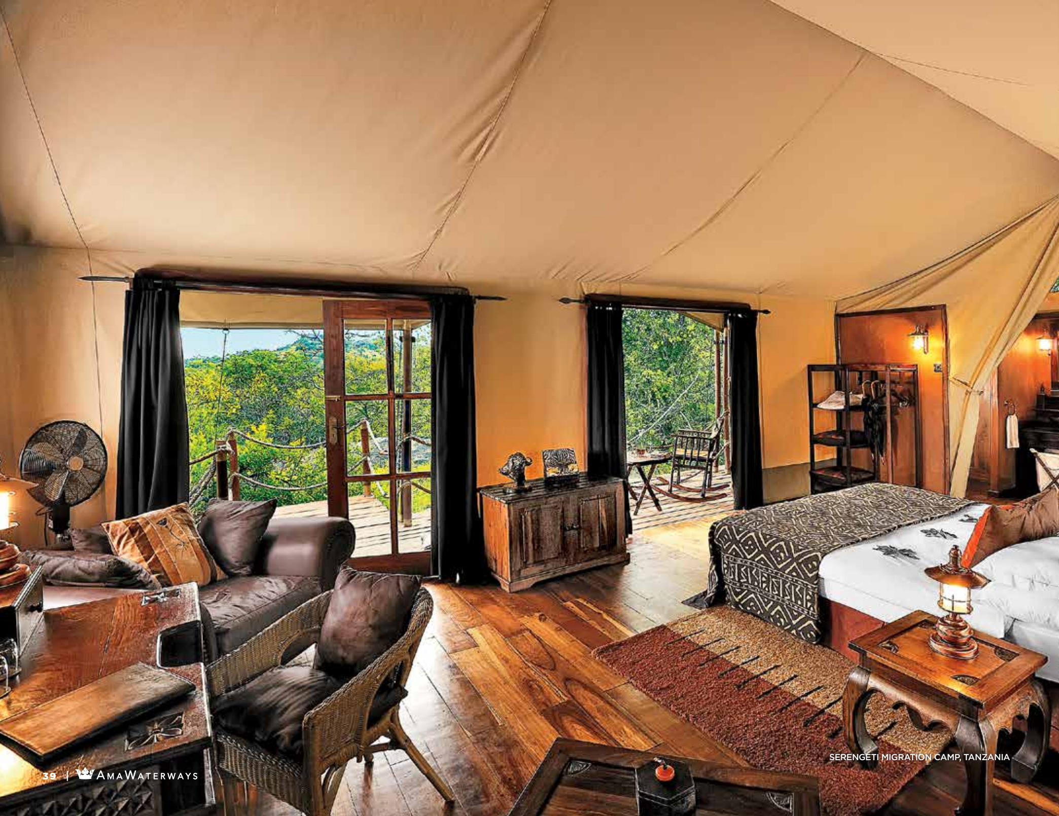
SERENGETI MIGRATION CAMP, TANZANIA