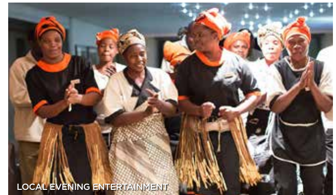
LOCAL EVENING ENTERTAINMENT

In addition to exhilarating safaris, enjoy a range of fun experiences on your Chobe River adventure. Hook a tiger fish or one of the many bream species such as African pike, tilapia or catfish. Prefer bird watching? Since the Chobe River is home to more than 450 species, you’ll be able to spot a host of birds, including African skimmers, rock pratincoles and the African finfoot.