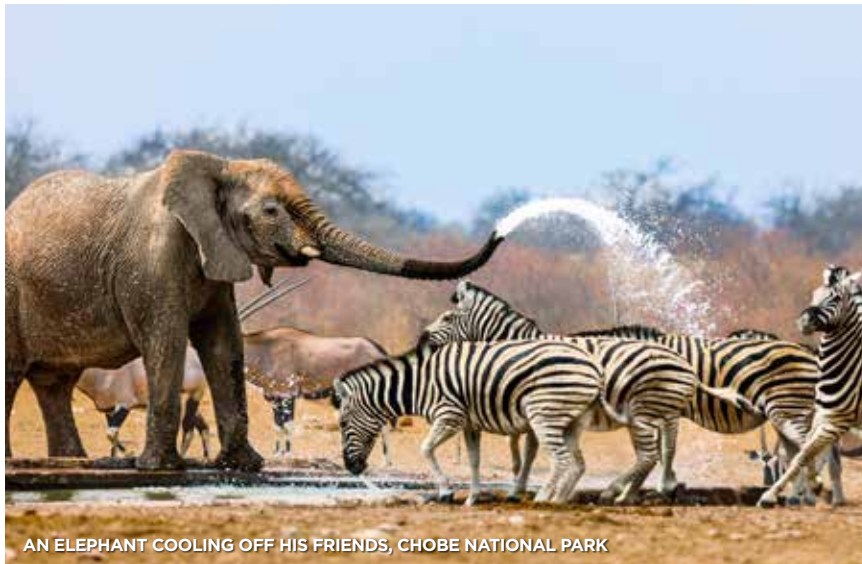
AN ELEPHANT COOLING OFF HIS FRIENDS, CHOBE NATIONAL PARK

The Chobe riverfront, situated in the extreme northeast of the park, attracts an almost unbelievable density of game, especially during the dry season, from March through November, when water inland is scarce and migratory animals head towards the river.