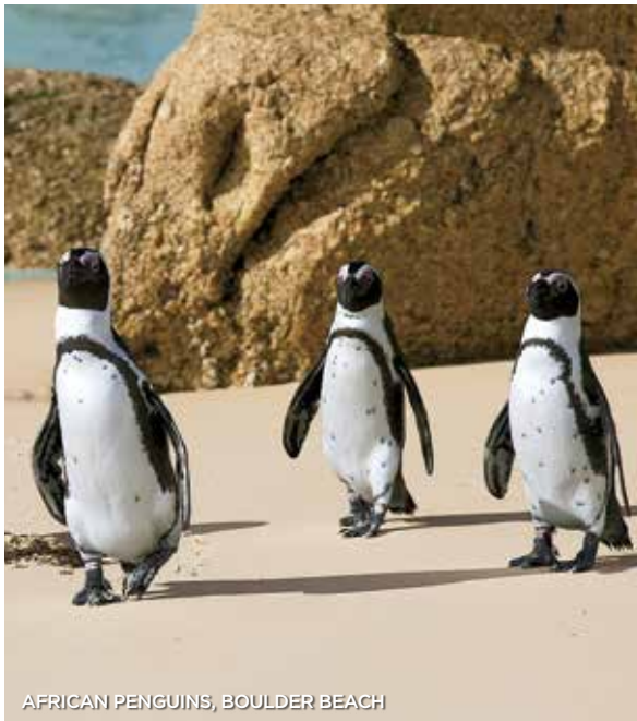
AFRICAN PENGUINS, BOULDER BEACH

An optional 4-night Rwanda post extension is available. Please see page 43 for more information.