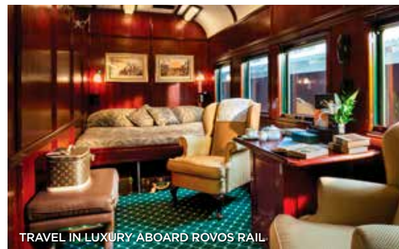
TRAVEL IN LUXURY ABOARD ROVOS RAIL

the staff attends to your every need, ensuring you an epic journey. Cap your evening off with an after-dinner drink as you settle into your luxurious deluxe suite.