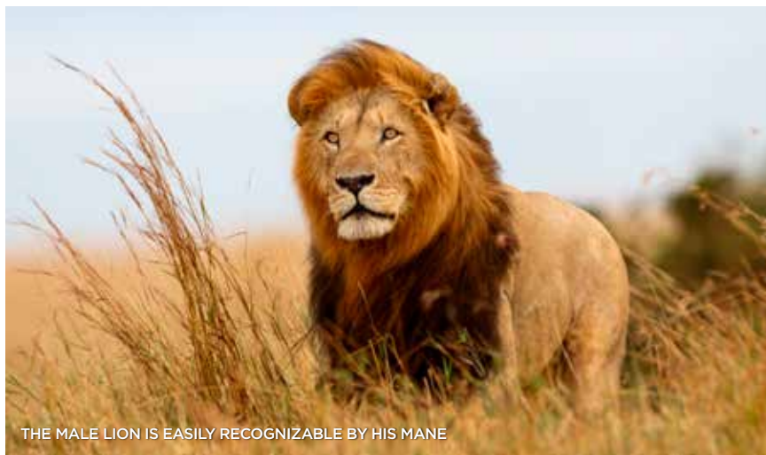
THE MALE LION IS EASILY RECOGNIZABLE BY HIS MANE

AmaWaterways guests taking part in either the Wildlife & The Falls or Stars of South Africa itineraries will visit the private Manyeleti or Timbavati game reserves. While there are no fences between the national park and the bordering reserves, allowing wildlife to roam freely, the reserves are not accessible for day visitors, meaning you practically have the bush all to yourself for an exceptional safari experience.