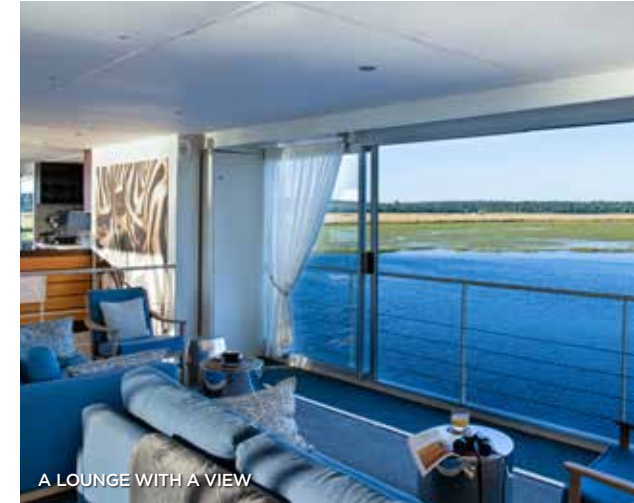
A LOUNGE WITH A VIEW